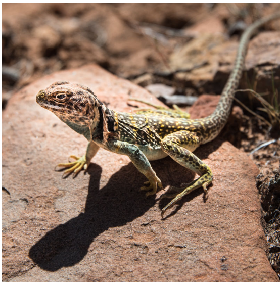
“Portrait of the Lizard” By Gosia Klosek

When I was on a photo workshop in Cuba six years ago, we went to a small town one evening for a special concert. While waiting for the festivities to begin, I wandered around the village square looking for something to shoot. I thought the shadows created by two street lamps looked interesting, so I sat on a bench in the darkness, waiting for someone to walk by. It was a pretty deserted street, so it took a while. Shot at f/2.8, 70mm, 1/80 sec, ISO 6400. I converted it to B&W and boosted the contrast.