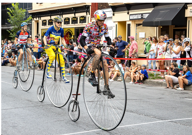
“High Wheel Bike Race”